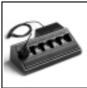
Multi-unit Charger PMTN4028