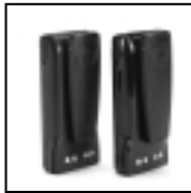
NiMH Battery & Belt Clip PMNN4008