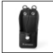
Carry Case HLN9701