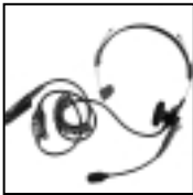
Light Weight Head Set AZRMN4018